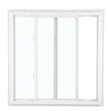
2-Lite Slider Available in Series 151/161 and Series 451/461