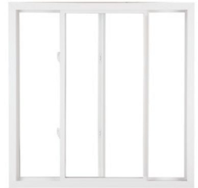
2-Lite Slider Window