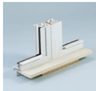
Choose the optional wood jamb extension and factory mull for simpler installation, without extra labor or materials.