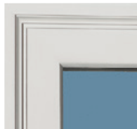
True brick-mould exterior.