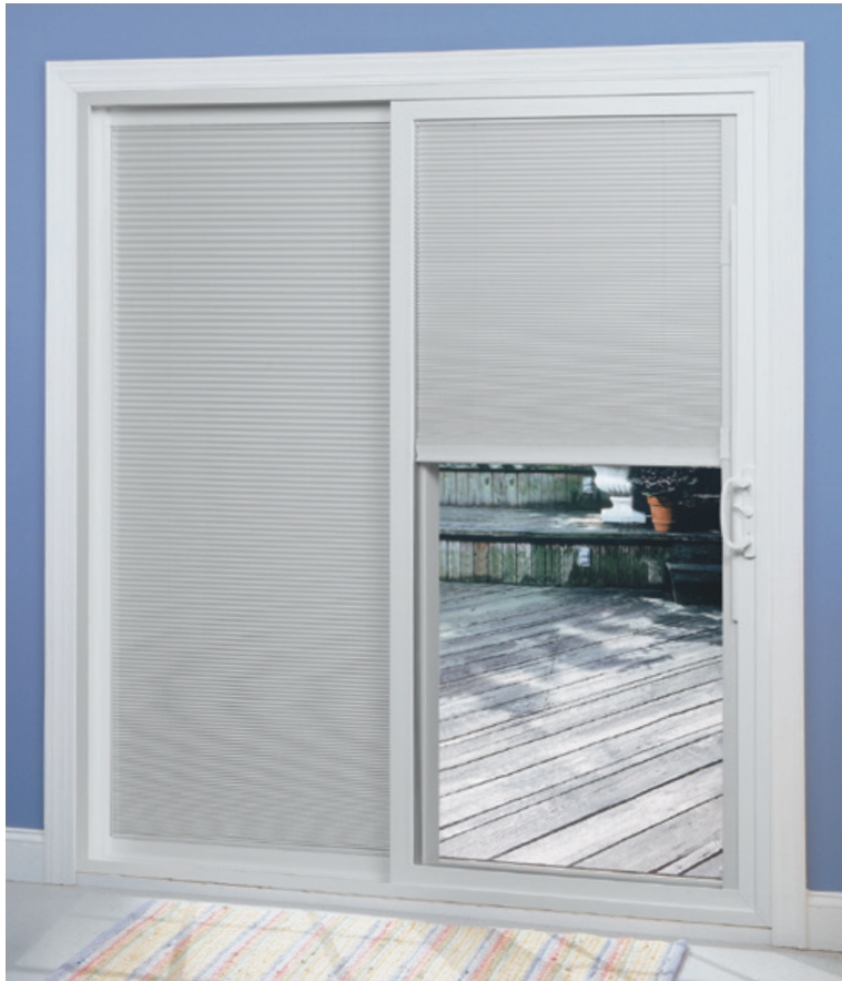
Series 312 Patio Door shown, also available in Series 332

WeatherLok vinyl sliding patio doors with blinds between panes easily tilt & raise with easy-access controls. Now you have blinds on a patio door without the snags or tangles of cords.